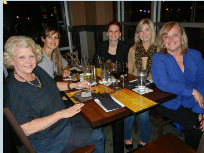
The last night of the conference, all the attendees met to celebrate another great conference at the DESTIHL Brewery in Champaign, IL.