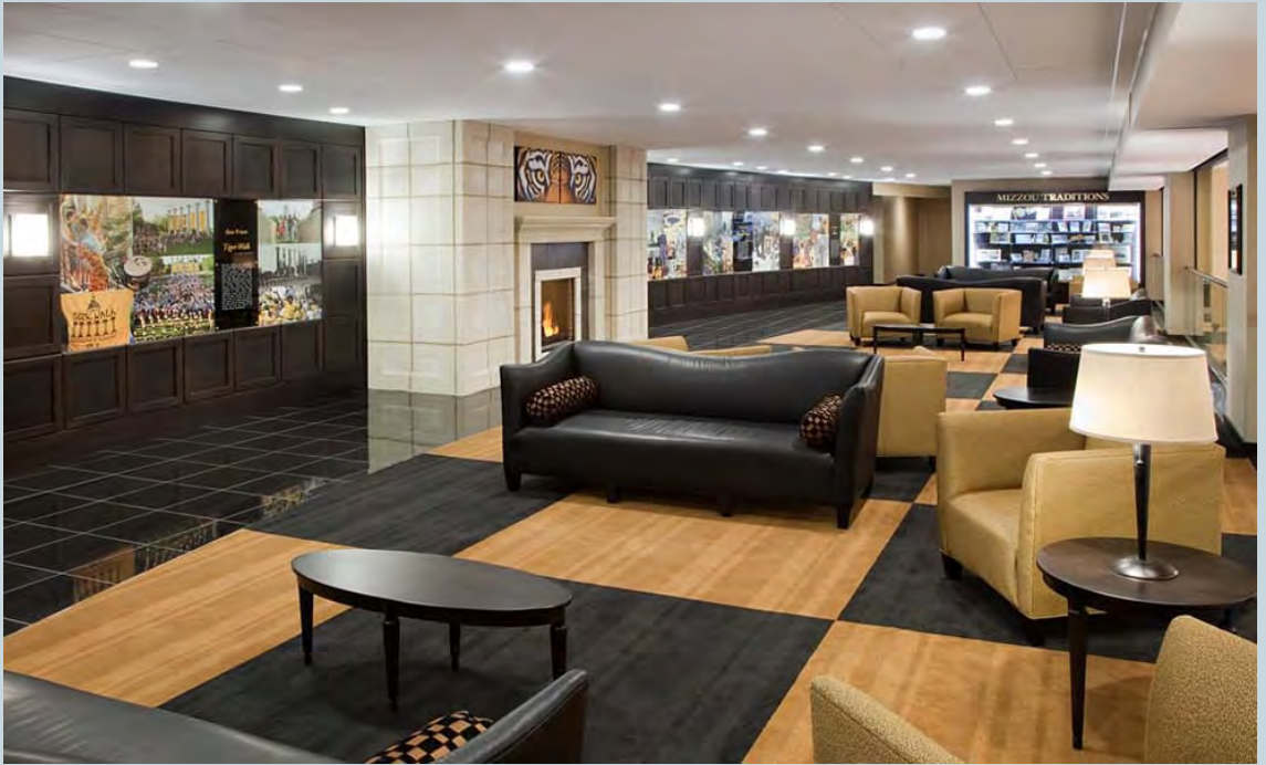
1st place - MU Student Center