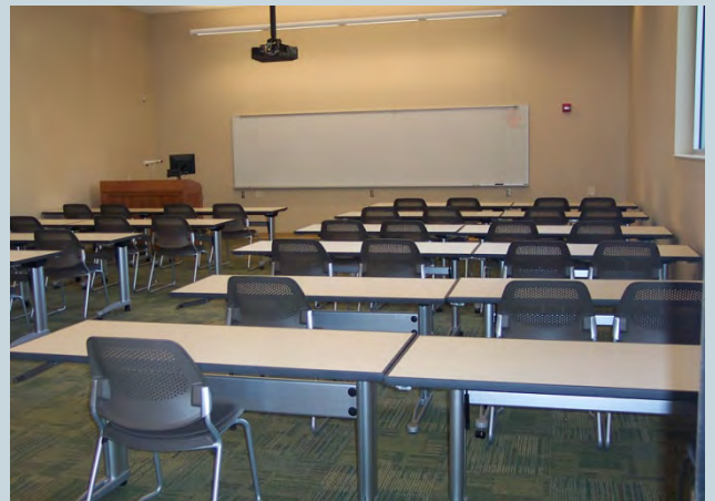
3rd place - Huff Hall North Addition