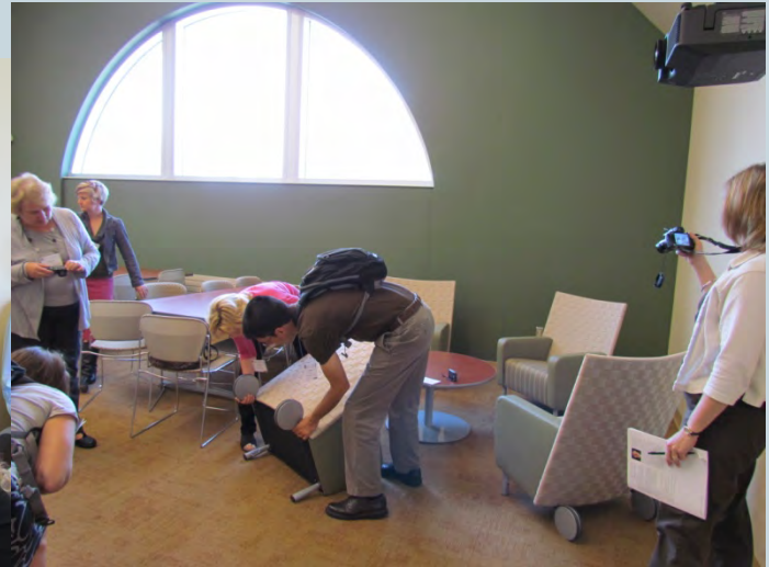
As usual, furniture inspections were ongoing at the conference.