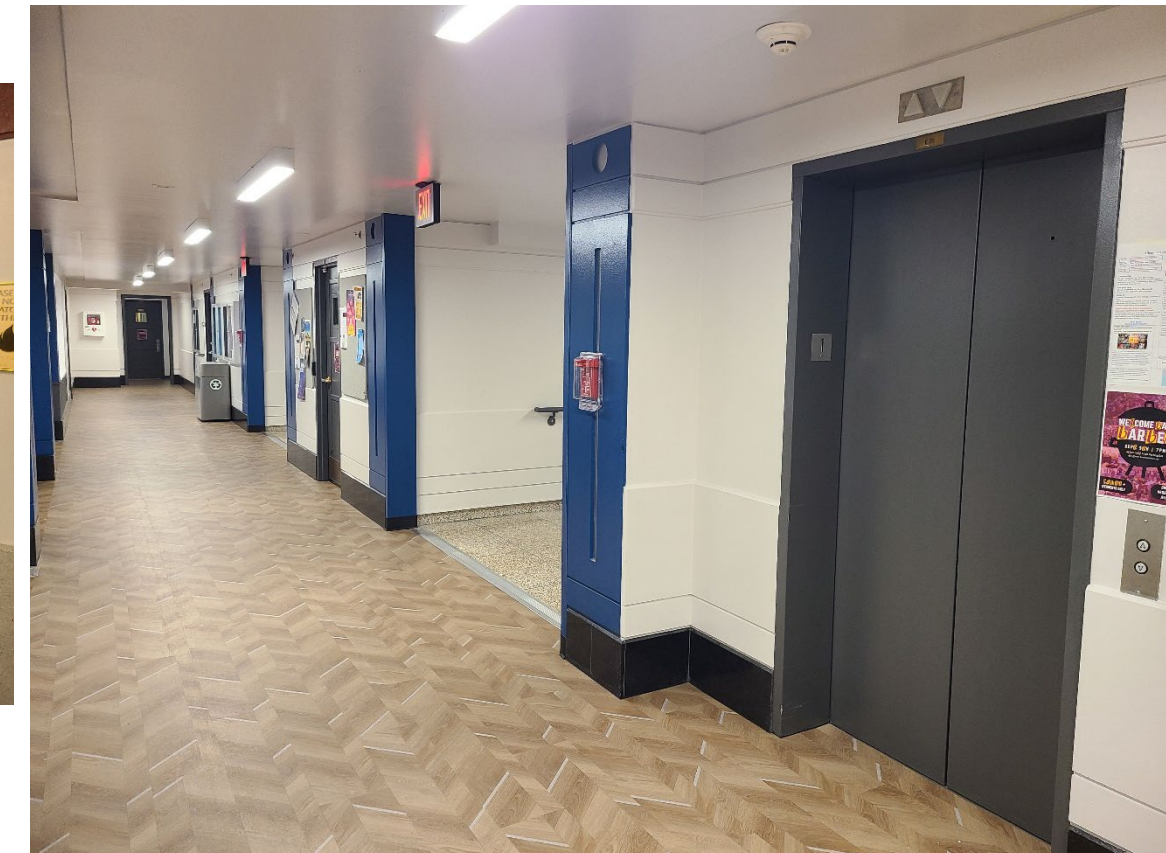
Allen Hall Lobby Remodel