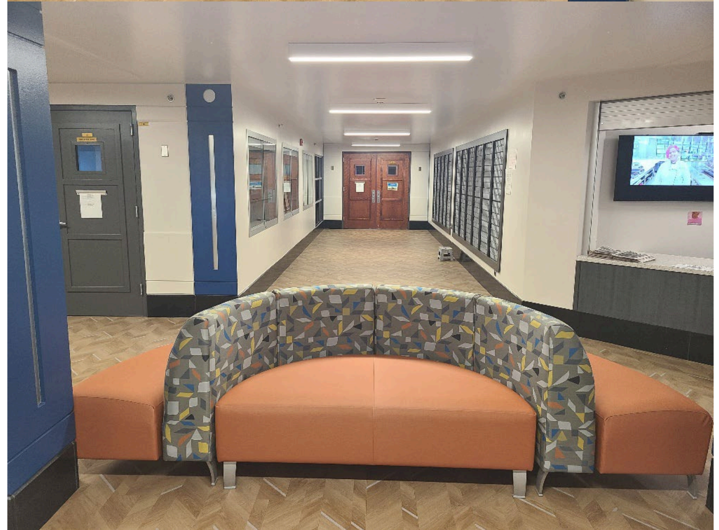
Allen Hall Lobby Remodel