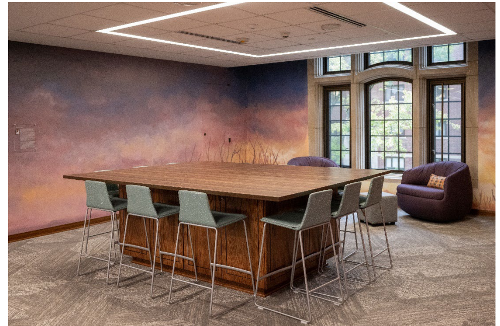
Asubuhi Multicultural Lounge Renovation