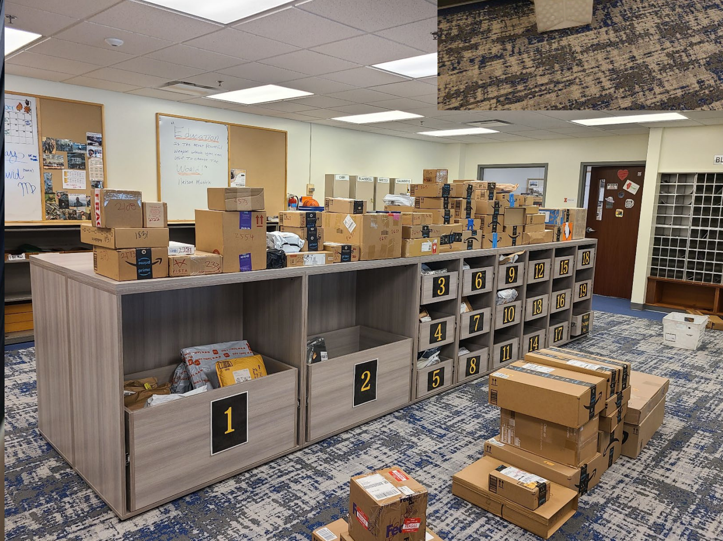
Pennsylvania Ave Res Hall Lobby Remodel