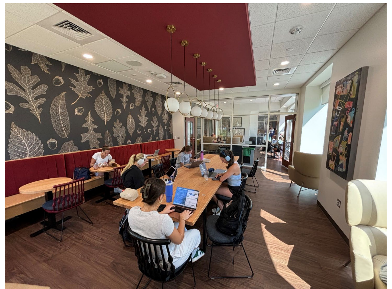
Acorn Coffee Shop