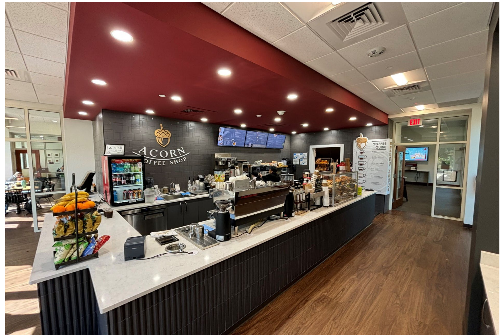
Acorn Coffee Shop