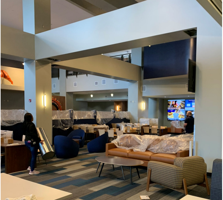
Hanging flags removed from area . New display can be seen in background.