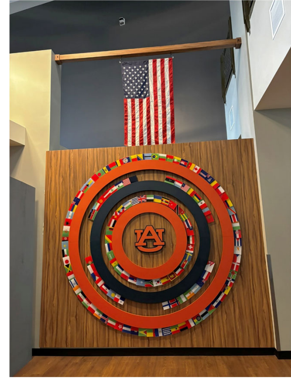
Melton Student Center Flag Display